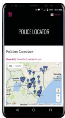
The 160 Girls app — 'justice in your hands'

One community member, excited to have downloaded the 160 Girls app, described the app as "having justice in your hands."